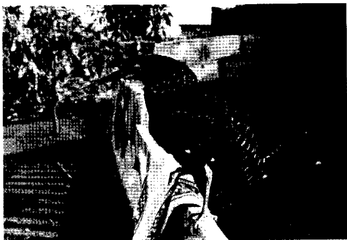
Figure 1 White-crested Bitter (Tiger Bittern) Tigriornis leucolopha . See text.